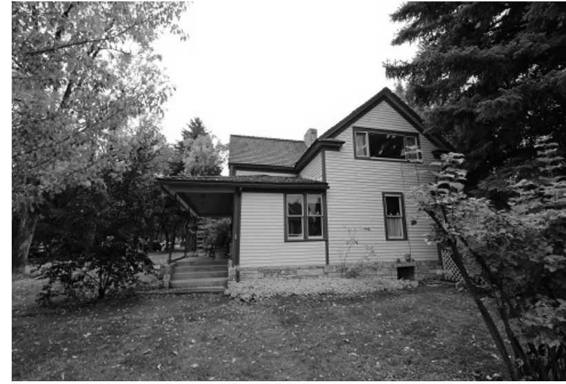
Existing Conditions Alderson Street View