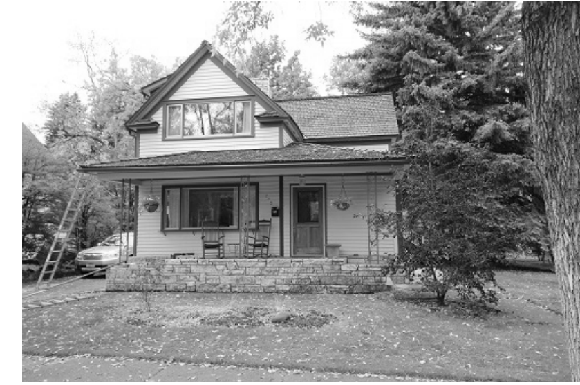
Existing Conditions South Grand Avenue View